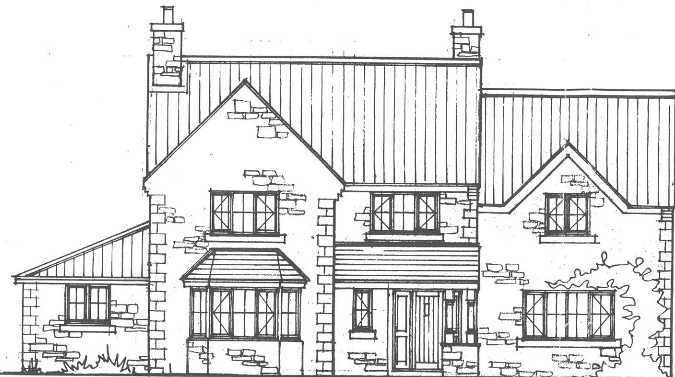
FRONT ELEVATION. 1:100

These drawings and all drawings prepared by Design and Materials Limited are the property of Design and Materials Limited and are protected under copyright. They must not be used, or reproduced in any form without the written consent of Design and Materials Limited. The plans and information contained therein are supplied for the sole purpose of the construction of the building, or buildings in conjunction with an all-package of architectural and materials supply services purchased from Design and Materials Limited.